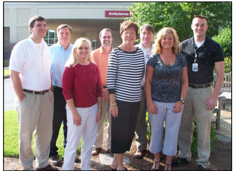
Redmond Regional's IT&S Team

HCA offers employees an array of benefits and rewards, including a variety of medical plans, healthcare and daycare flexible spending accounts, 401(k) plan with 100% match, flexible work schedule and