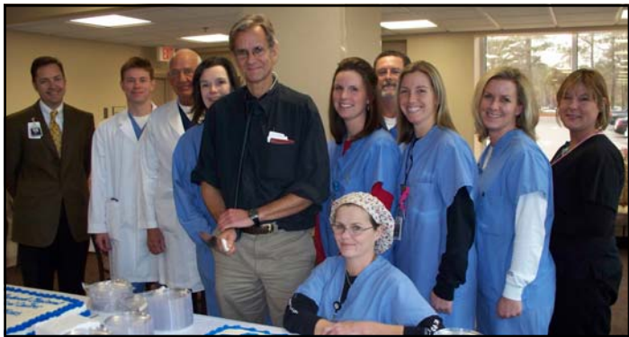
The Redmond team celebrates the Chest Pain Center Accreditation

Redmond Regional Medical Center recently received full Cycle II accreditation with PCI from the Accreditation Review Committee.